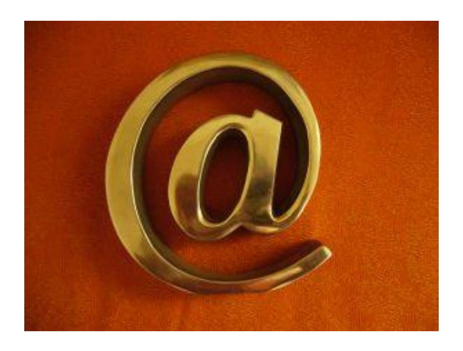
Email Marketing Mogul Tips For Email Campaigns That Really Work

Using the electronic mailing system otherwise known as the email is one way of sending a commercial message to a target group audience. This is done for the purpose of getting the desired attention for the business through internet marketing platforms. You get all the help and info you need here.