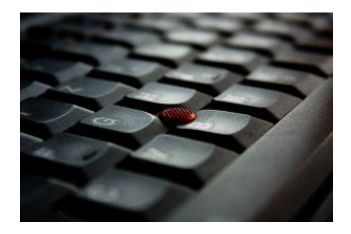
Expert Interviews For Extra Traffic

Expert interview is an innovative way of producing and sharing information. In the ever changing interest and lifestyles of people today there are a lot of different ways of reaching an individual with the intention of sharing information.