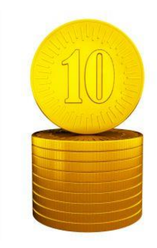
The Passage To Passive Income

Any income where the individual does not have to physically earn is called passive income. This of course is a very attractive way of earning an income and indeed those who are lucky enough to make a decent living this way are quite happy.