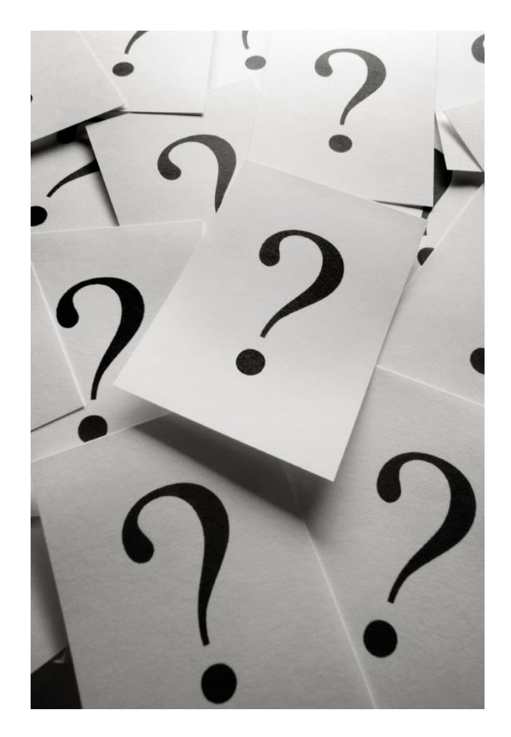
True Calling And Life Purpose Rediscovered

Your objective is actually very simple. To become successful all you have to do is reach a state of complete inner peace. As you know, this is easier said than done in today s hectic world. If you are willing to shatter your current belief system and take a leap of faith, this will be a voyage like no other. Remember ... in order to continue, we all must have open minds so we can find OUR TRUE CALLING!