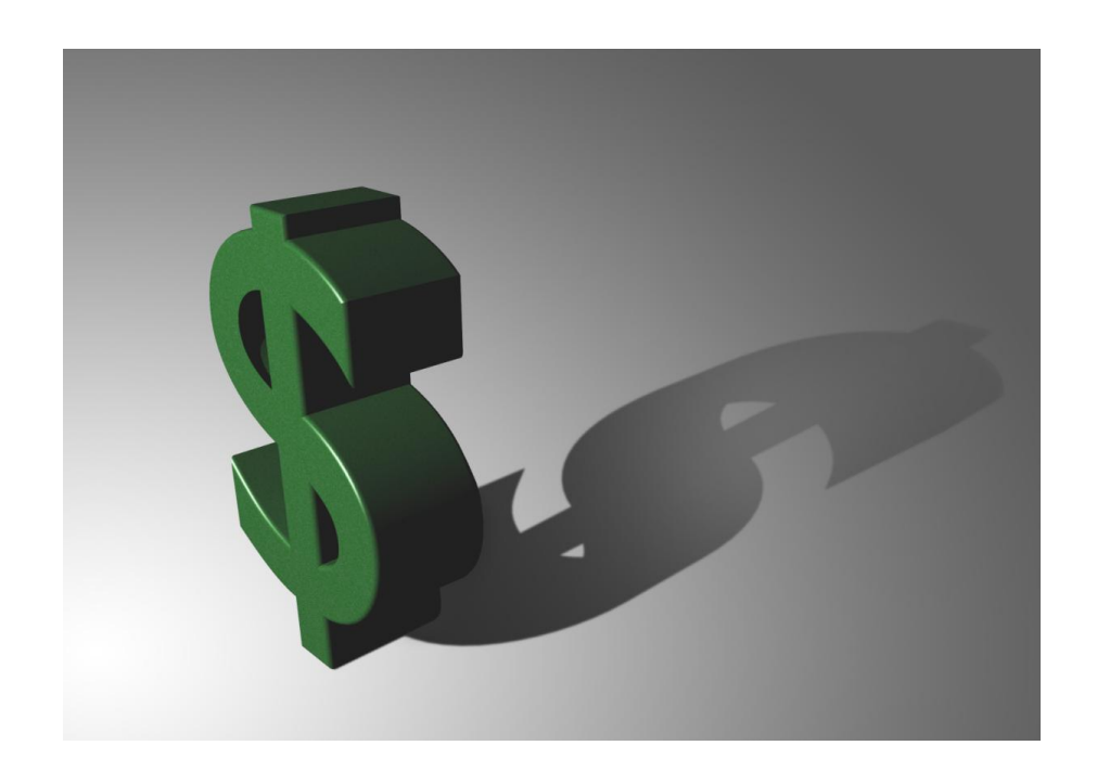
Better Business Budget Planning

All businesses start out with three main elements prominently featured in the general make up of the endeavor. These would be listed as revenue to be earned, expenses to be incurred along the way and the projected profits expected. These three categories are usually studied in depth before the actual business entity is launched and through this process there is always the need to have an effective budgeting platform in place. Get all the info you need here.