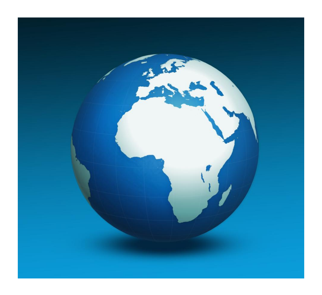
The Business Brains

A business plan is guidance, an important assistant for anyone who starts or runs a business. Business plans may consume some time to make them, but in the long term, you may save much time and cash flow. Get all the info you need here.