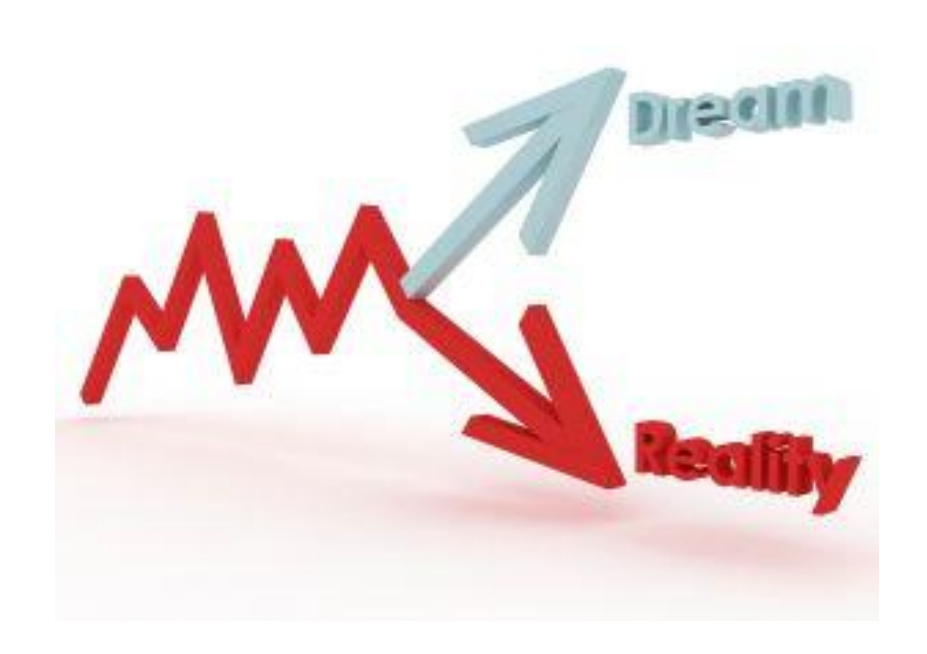
Entrepreneur And Employees

Starting a home based business has become a very popular way of earning a comfortable income without the hassle of being in the regular rat race that so many people have no choice but to be in. however in making the choice to commit to a home based business the individual should be aware of the various element and requirements it entails in order to keep it a success rather than a burden. Get all the info you need here.