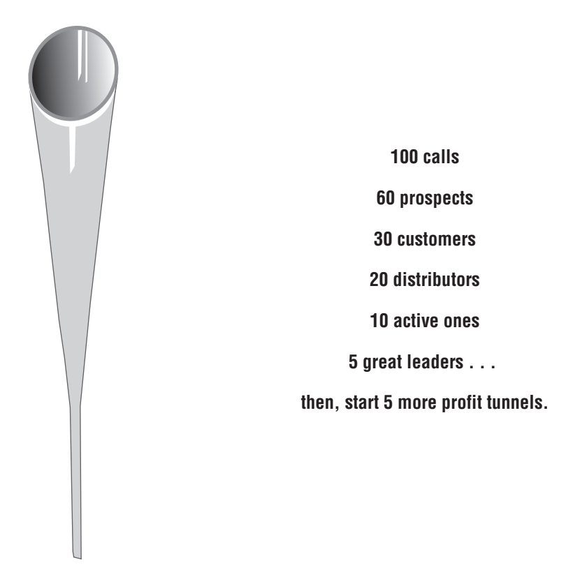
Figure 35.1 The Funnel Concept

exponential growth you will have. The law of increasing returns is the opposite of "get rich quick." The key is to stay committed after picking a company that has systems in place, offers quality tools and events, and has leadership providing support.