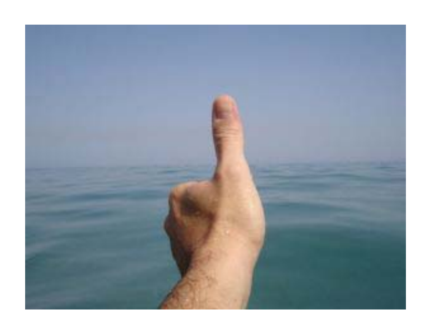
Body Language Mastery

Body language is another form of subtle communication often practiced consciously or unconsciously. This "language" is fast gaining the interest of many people. Body language though very relevant but can sometimes be wrongly interpreted, however it is still useful.