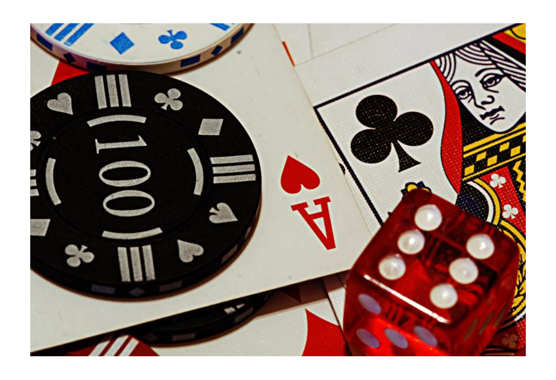
Get Off The Gambling Train

Some people prefer to treat their gambling problem themselves and this is possible if the individual is very disciplined about the whole exercise. With the discipline factor dominant in the equation, the individual will be able to explore all the various exercises that would be part of the self treatment basics. Get all the info you need here.