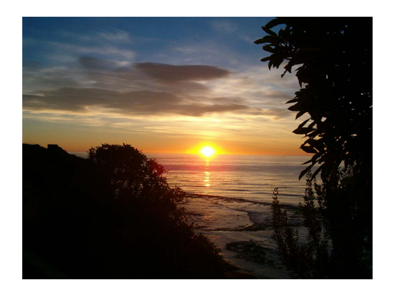
Law Of Attraction: Positive Habit Attraction Models Methods That Will Help You Construct Good Habits Easily.

In any instant, you've the freedom to consciously choose how you wish to spend your time. You are able to focus yourself in the here and now, stay totally aware of everything you do, and make really calculated movements.