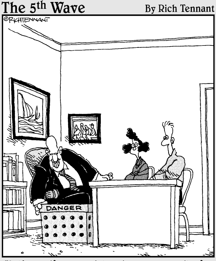
"Let's see if we can determine your capacity for assuming risk. Now, how familiar are you with snake handling?"