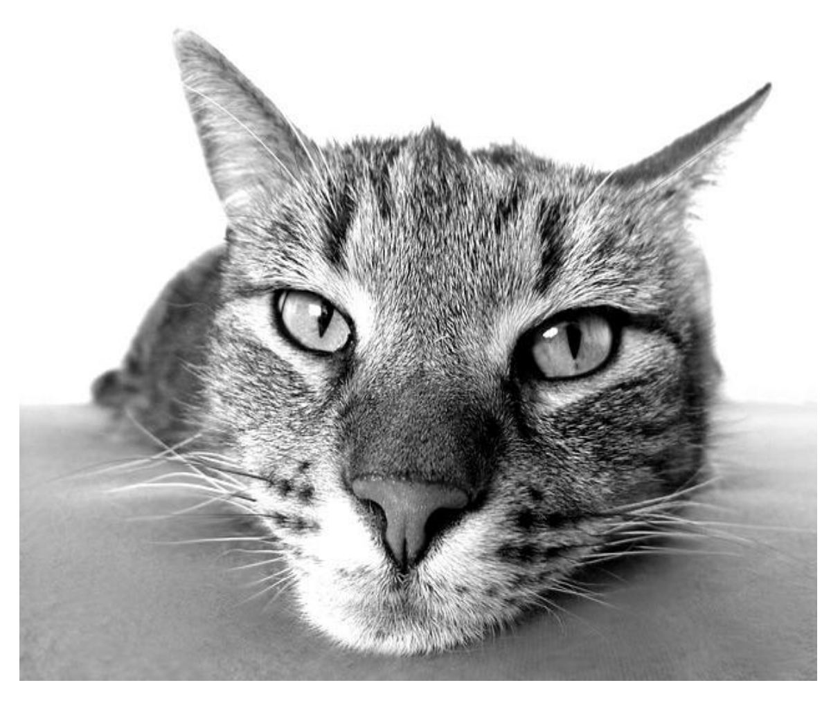
Cat Training Techniques

Training cats is very different from the training techniques used to train dogs. Cat will rarely do anything simply to please their owners, especially if there is nothing in it for them or they simply do not feel like complying at the time the request or commands are given.