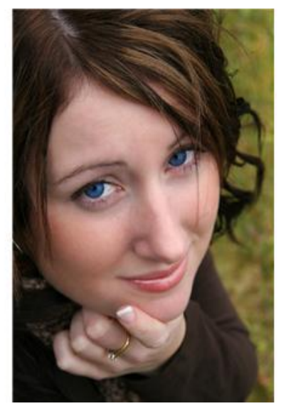
Abolish Acne What You Need To Know About Getting Rid Of Acne Once And For All

Dealing with acne may be embarrassing at any age. Fortunately, there are a number of things you are able to do each day to make certain your skin is less prone to flare ups.. Get all the info you need here.