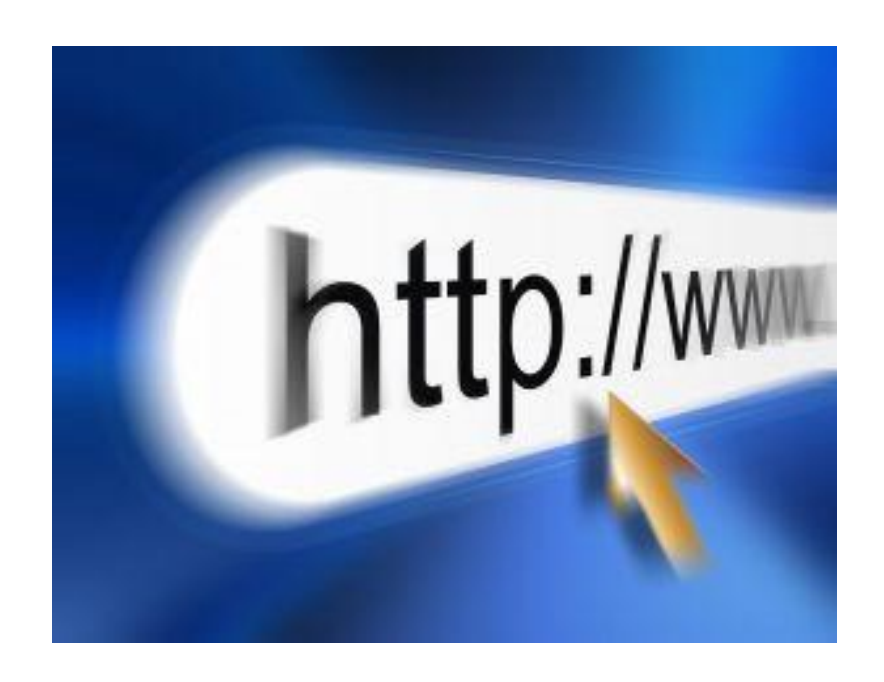
Video Marketing Master

Marketing a product well is the basis of any promotional campaign. As there are a lot of ways of doing this and getting the product to a platform where it is commonly recognizable, serious consideration must be given to the mode of adverting used. Video can assist with that.