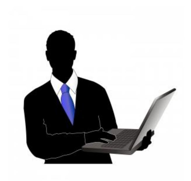
Guest Posting Secrets

Guest posting is a relative new tool that in being used to internet marketing but it is fast gaining credibility and popularity. The novelty of this new style is quite refreshing especially if the material posted in innovative, entertaining, and informative all at the same time.