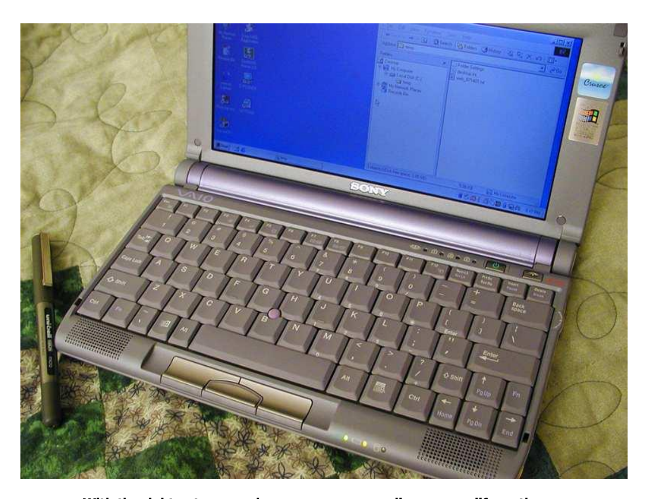
With the right autoresponder program, you can live an easy life on the go.