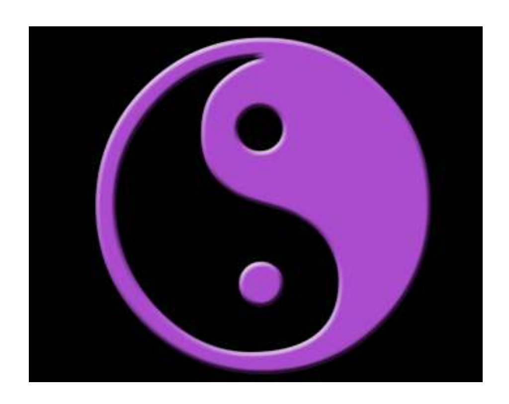
A More In Depth Look

The yin and yang concept is applied in many areas with successful results. One such area is in the practice of the Chinese classic medicine field. The harmonious energies and functioning of the various organs and body parts working together is the reason optimum health is achieved. Loosely explained the right balance of negative and positive must achieve the psychic equilibrium in the quest for good health and longevity.