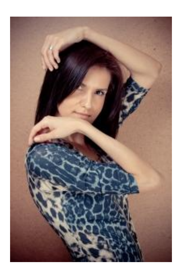
Image is almost always a dominant factor in confidence, therefore having a good image in the form of a healthy and attractive body, will automatically boost the self-confidence levels of the individual. The connection between the way in which the individual perceives his or her body conditions definitely plays an important role in the confidence exuded.