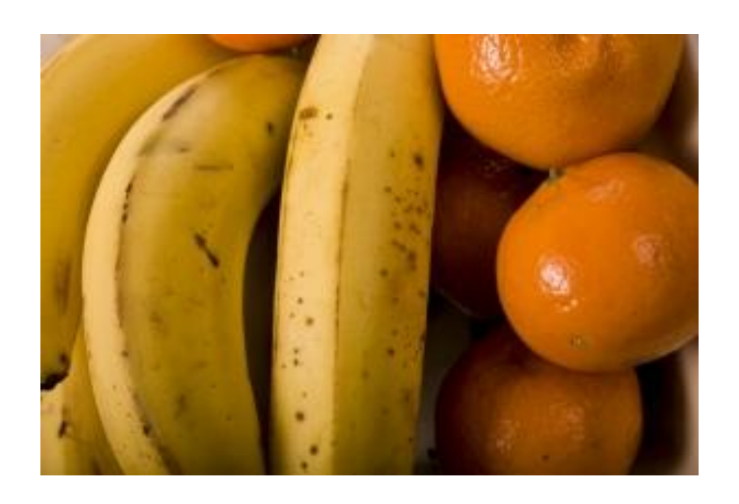
Nutrition for Kids Essential nutrients for children all parents should know

Children today are more likely to consume foods that are delicious rather than nutritious, and most foods that come under the delicious category are usually either highly sweetened or salted, either way the delicious choice is not good for the child at all. Get all the info you need here.