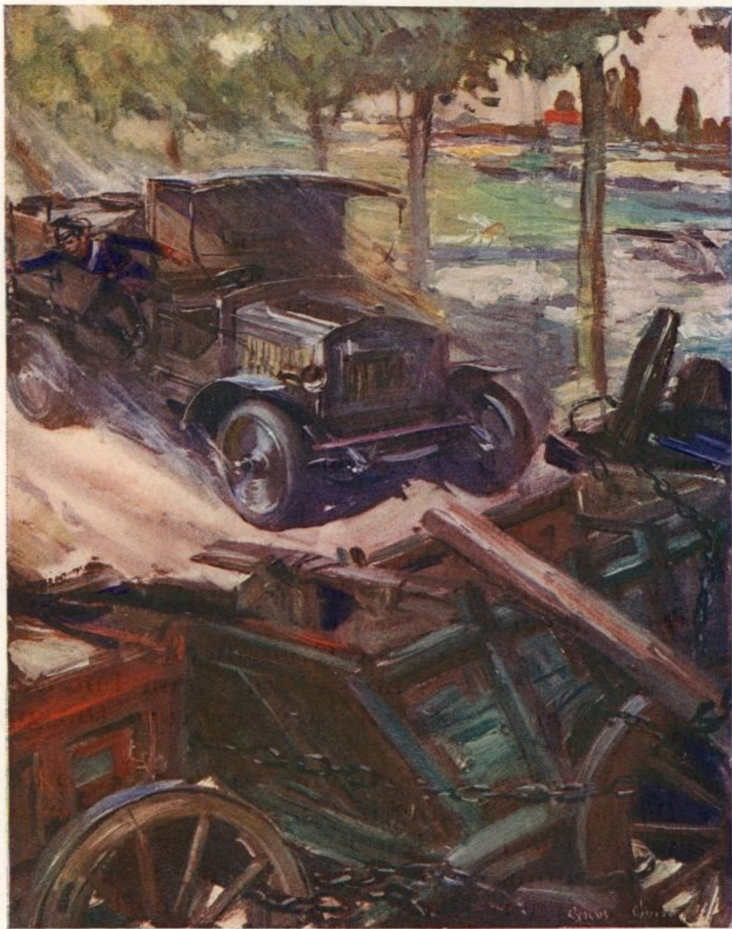
CLEARING THE ROAD