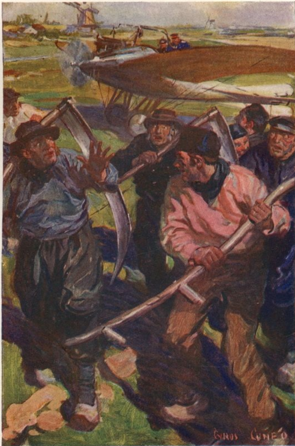
"THE PEASANTS SCATTERED OUT OF ITS PATH"