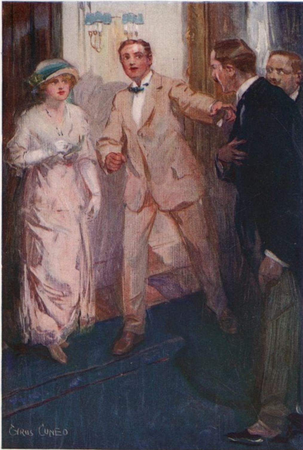
THE SPY UNMASKED