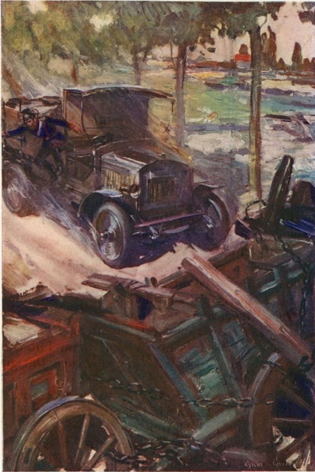
CLEARING THE ROAD